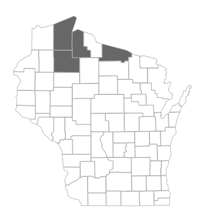
Northern Wisconsin Service Area

This study measures the economic impacts created by LCOOU on the business community and evaluates the return on investment to LCOOU's primary stakeholders-students and Wisconsin society—as well as the benefits received by U.S. and Wisconsin taxpayers from LCOOU. The following two analyses are presented: